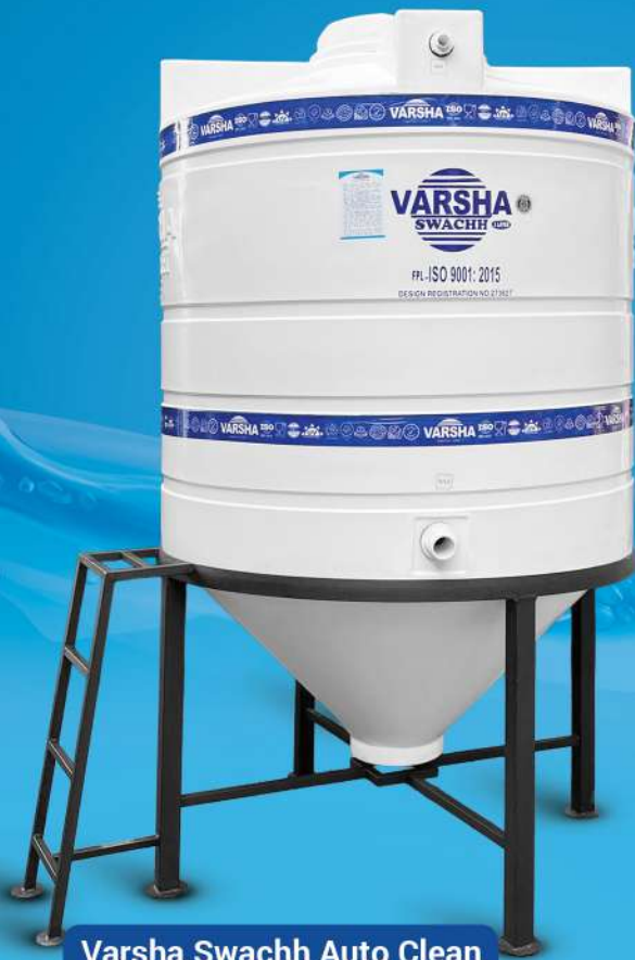
Varsha Swachh Auto Clean Water Tank(1750 ltr)