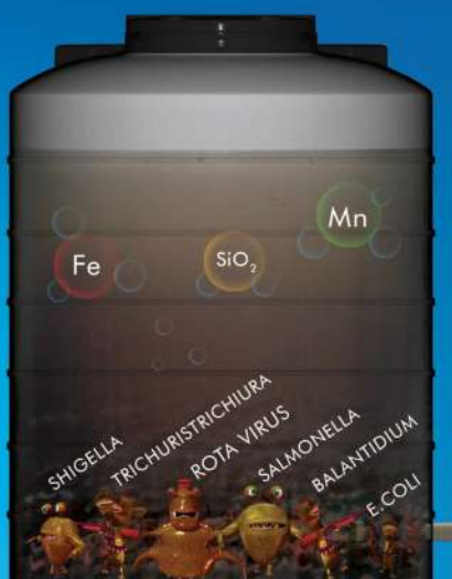
Traditional water tank contaminated by disease causing germs