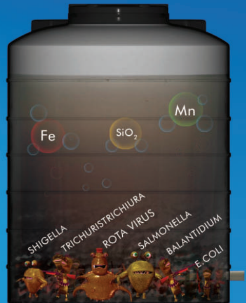
Traditional water tank contaminated by disease causing germs